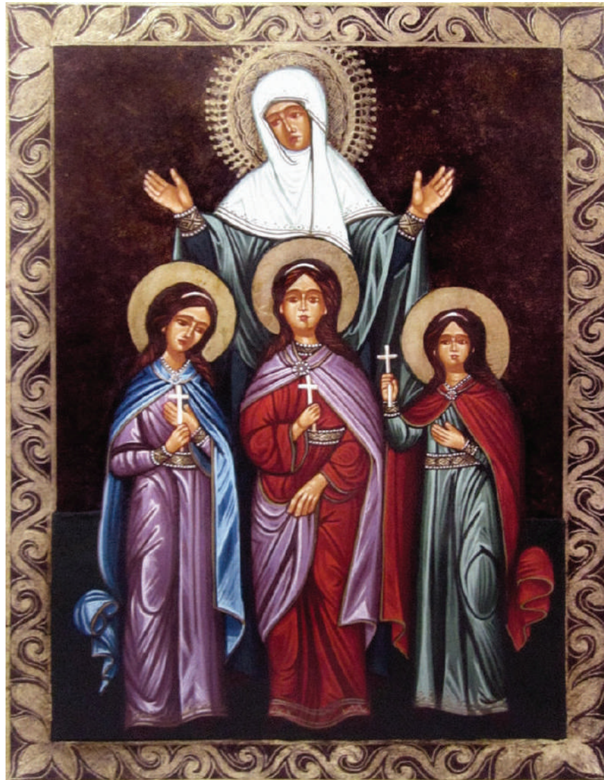
Saint Sophia and her three daughters: Faith, Hope and Love

FEBRUARY 3, 2019 FOURTH SUNDAY IN ORDINARY TIME