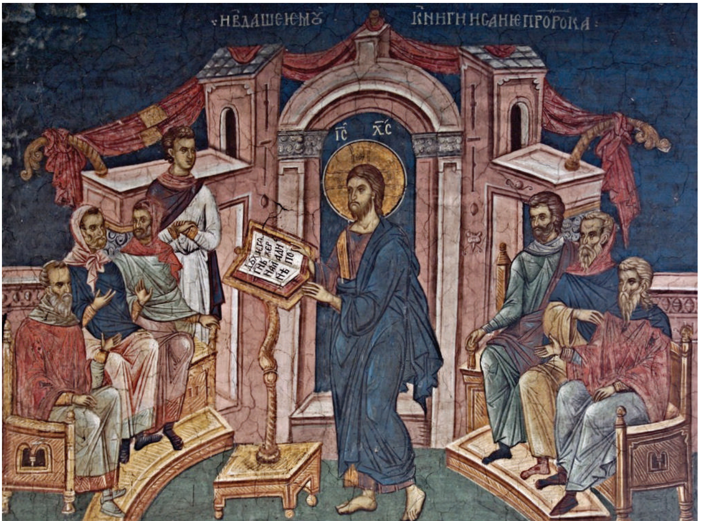
Christ in the synagogue of Nazareth. Museum: Visoki Decani monastery, Kosovo. 14th century.