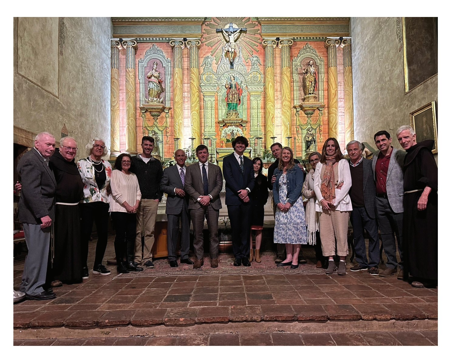
O LORD, let the light of your countenance shine upon us! You put gladness into my heart. Psalm 4:6-7